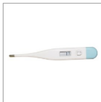
First Aid Standard Digital Thermometer