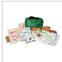
First Aid Kit Industrial Soft Pack 1-25 Person