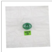
Emergency Resuscitator CPR Shield Non-Contamination One-Way Valve