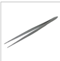
First Aid Splinter Tweezers