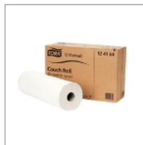
Tork C1 Universal Couch Roll 58cmx170m, 425 Sheets