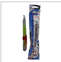
Safety Light Glow Stick Green