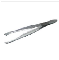
First Aid Oblique Tweezers