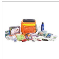
Grab And Run Civil Defence Survival Kit