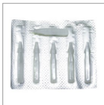
Splinter Probes Non-Slip Handle Plastic Cap, Pack of 5