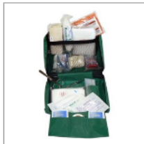
First Aid Kit Vehicle & Lone Worker 27 Piece