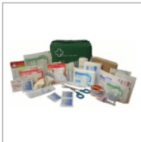
First Aid Kit Office Soft Pack 1-12 Person