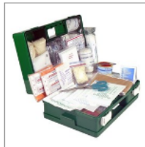
First Aid Kit Office Hard Pack 1-12 Person