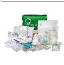
First Aid Kit Soft Pack 1-5 Person 55 Piece