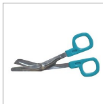
First Aid Stainless Steel Medical Scissors