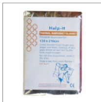
Help-It Thermal Emergency Survival Blanket 130x210cm