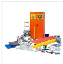
Civil Defence Emergency Cabinet Plus Contents 1800mm High