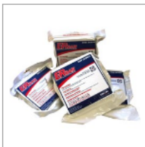
Emergency Food Ration Bar